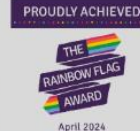
PROUDLY ACHIEVED THE RAINBOW FLAG AWARD April 2024