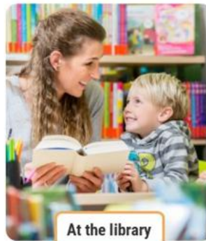
At the library